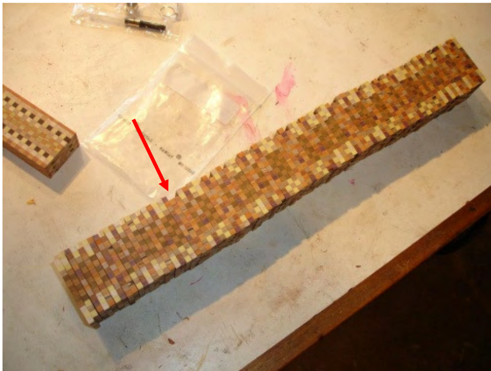
Arrow pointing mistake in size

With the piles of cutting boards, randomly arrange them into a long board, or you can develop a pattern if you prefer. Some piles are bigger than others, so a little of this and a few more of that, flip this way, over and under, then Walla! You might notice in my example there is a stack that is 1/8 narrower than all the others...oops! That means I accidentally made a stack of 9 earlier instead of 10. No biggie.