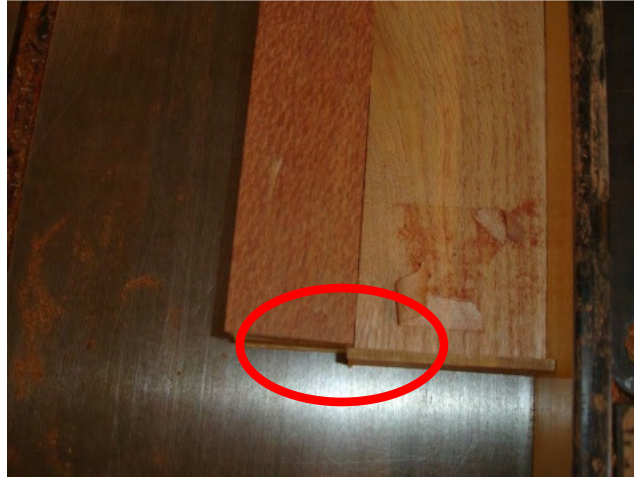
Lip on push jig

A jig is used to re-saw the stacks into 3/16" wide strips. The tail on the jig assists in pushing the stack past the blade and a push stick is used to hold the stack down. I remove one strip from each stack. This part is important! Place the saw mark side of the thin strips in a pile facing up. Take the stacks and run them back through the drum sander to remove any saw marks and then cut one more strip from each stack. Keep repeating this process. This keeps the stacks square in case of any blade deflection. After all the strips are cut, each strip is then passed through the drum sander with the flat side down and finish sanded to 1/8" thick.